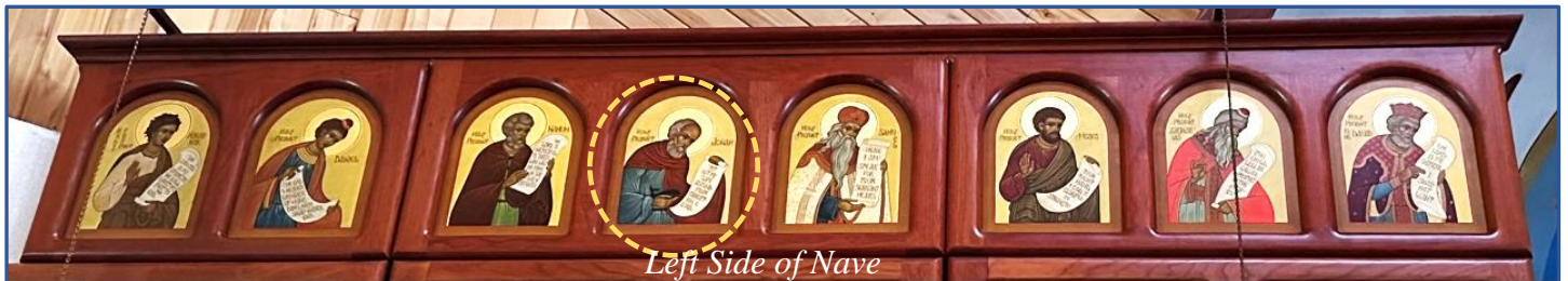
Left Side of Nave

Answers to this question will be highlighted in the bulletin each Sunday